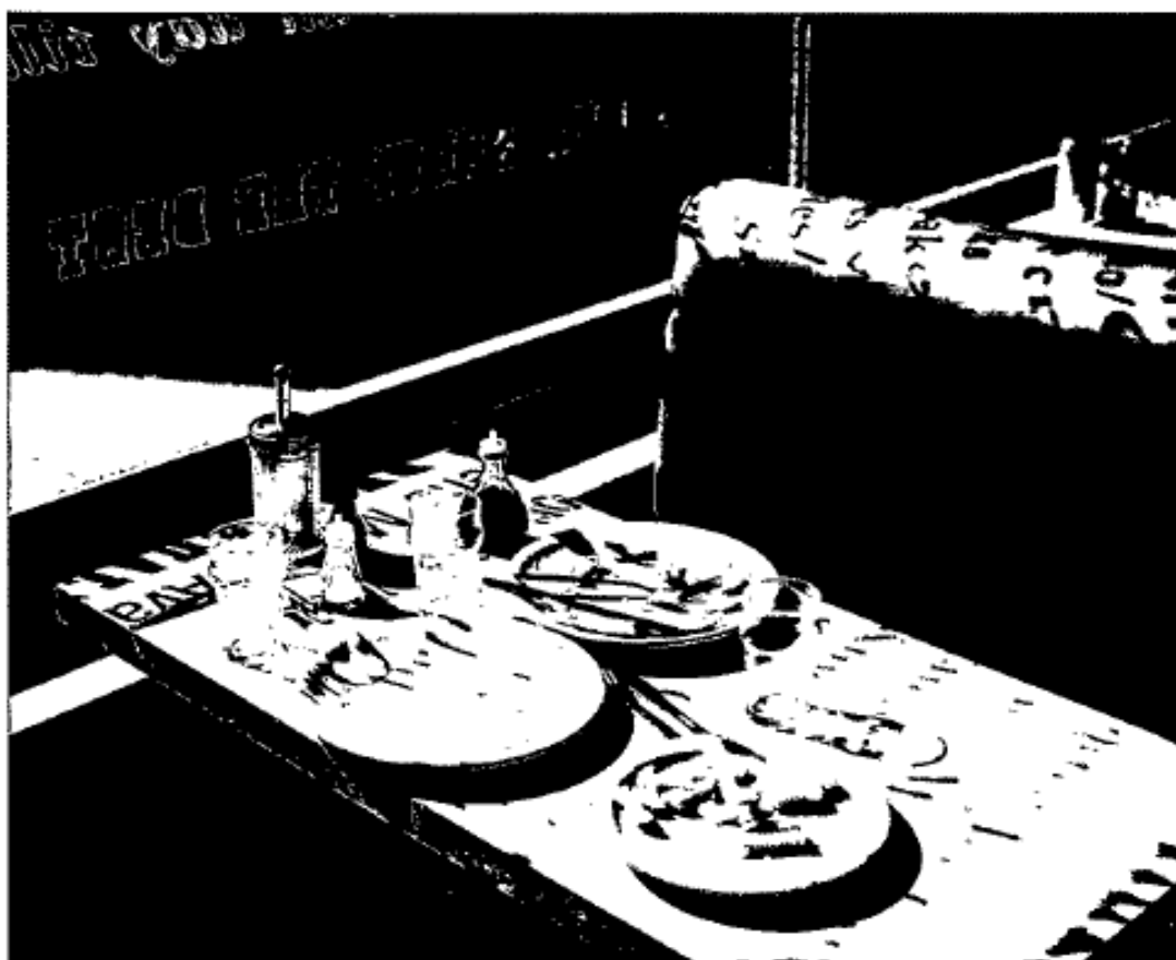
Untitled #6 (2019) by Ian Howorth

Refer to this image on the supplementary sheet when answering question 11.